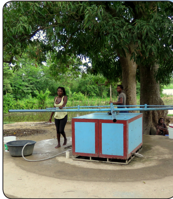
Village of Garde Saline, Haiti

Proceeds from this ride support Rotary International Water & Sanitation projects like these.